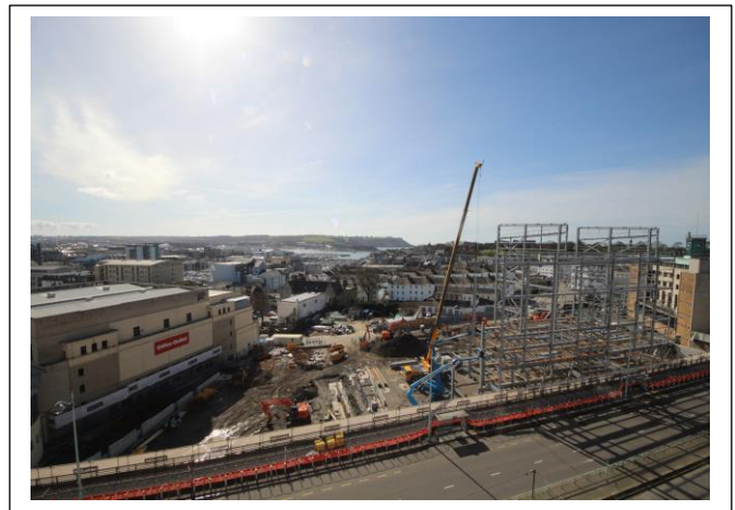
View from Primark