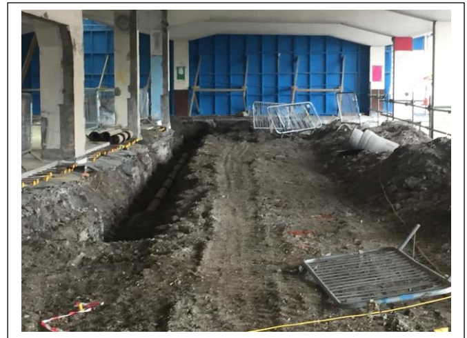
Drainage installation to undercroft ongoing.

Works programmed for the next week include: