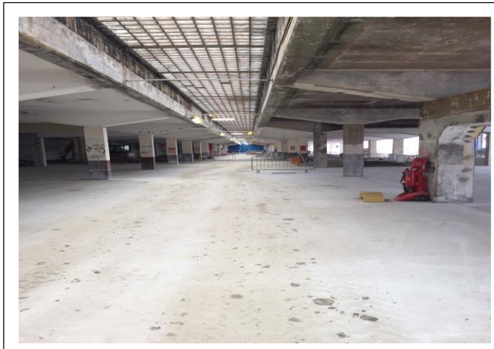
Prep work to undercroft completed ready for render repairs and decoration.