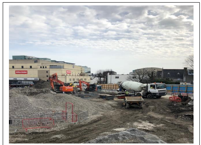
Prep work to Zone 5 ready for steel erection next week.