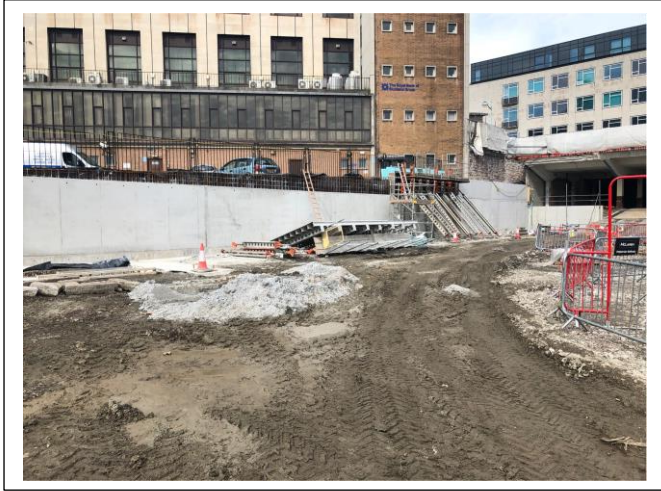
Concrete pours ongoing to RBS retaining wall