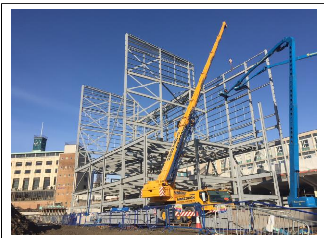
Steelwork installation commenced to Zone 2.